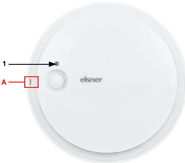
Fig. 1 1 Brightness sensors

A Recess to open the housing. When closing the housing, the recess aligns to the marking on the skirting